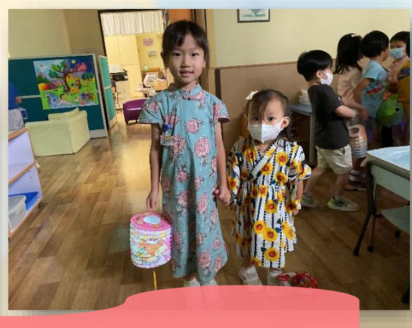
September Birthday Party and Lantern Festival