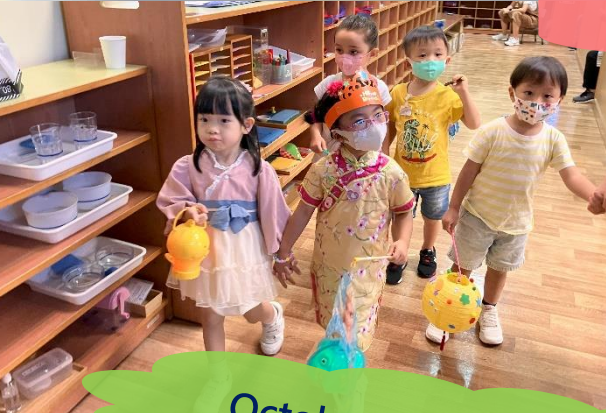
October Birthday Party