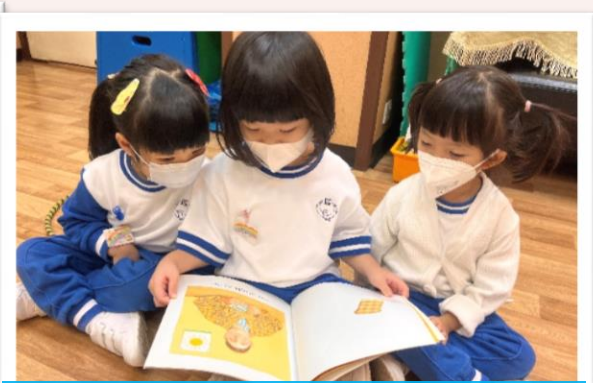
Let's read a storybook about family together.