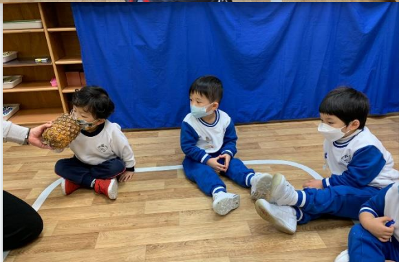
The pineapple smelled so good!