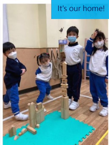
It's our home!