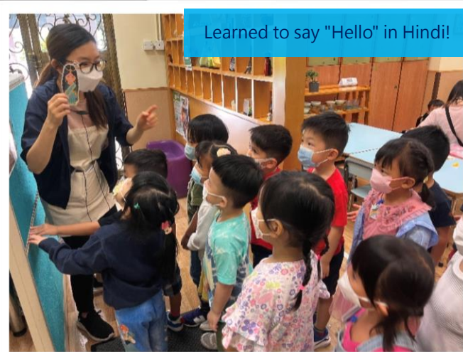
Learned to say "Hello" in Hindi!