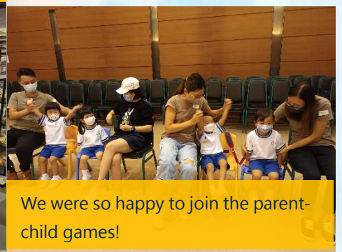
We were so happy to join the parent-child games!