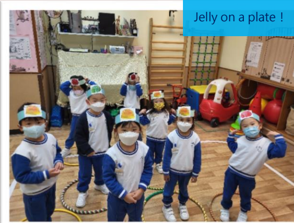
Jelly on a plate !