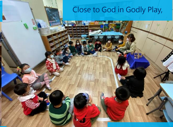
Close to God in Godly Play,