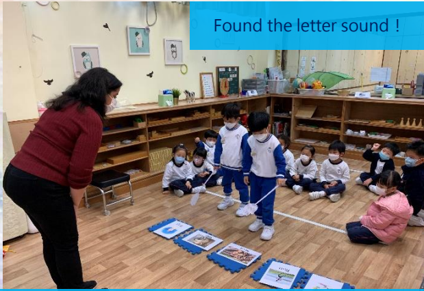
Found the letter sound !