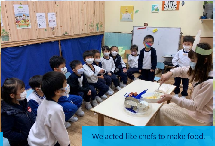
We acted like chefs to make food.