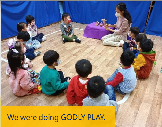
We were doing GODLY PLAY.