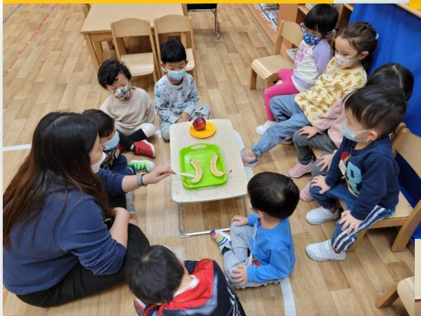
It turned out that bananas have cores.