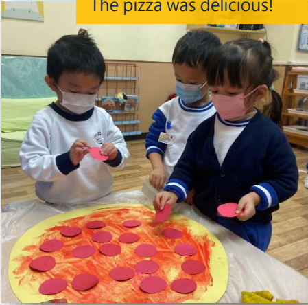
The pizza was delicious!