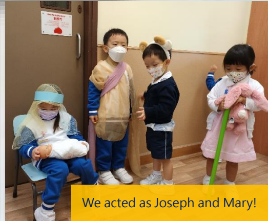
We acted as Joseph and Mary!