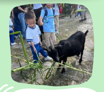
Not only were the "angels" happy during the school trip, parents were also very happy and prepared a "big picnic" of food together! Thank you to the school for making everything smooth on the day!