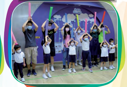
Parent-child sports day