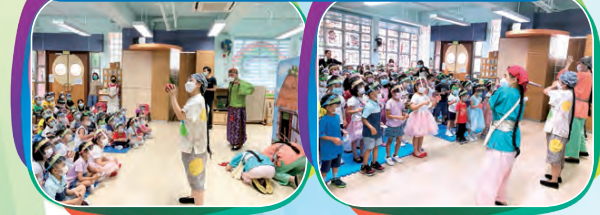
The Hong Kong Repertory Theatre: The Little Prince as an Ordinary Boy