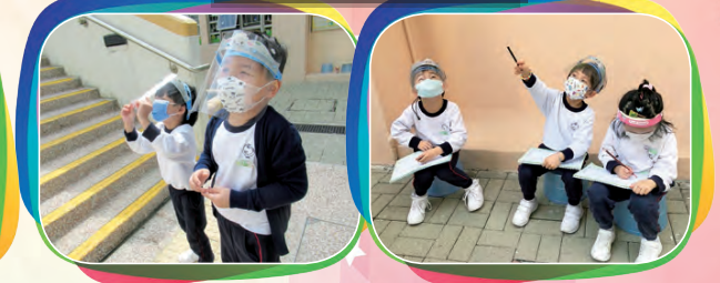
Observing the sky